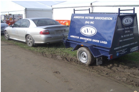
Regardless of conditions, we get there