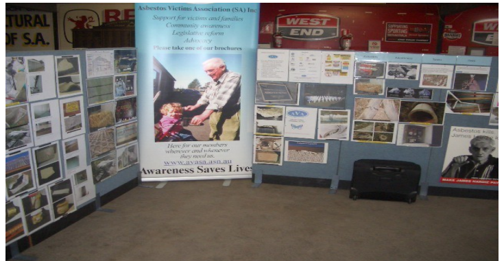
Part of one of our displays in a regional area