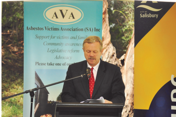
Premier Mike Rann