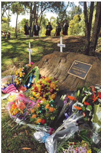
Asbestos Memorial Stone