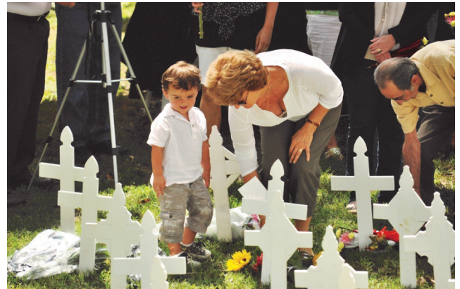
Remembering loved ones