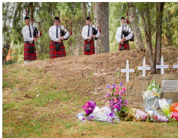
Pipers of the Royal Caledonian Society SA