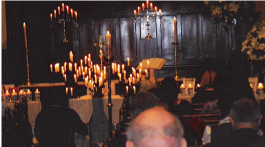
Candle-lighting during the service

Workers Memorial Day this year was well attended and generated a lot of media attention.